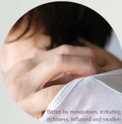
Bitten by mosquitoes, irritating itchiness, inflamed and swollen