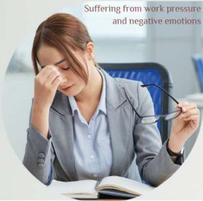
Suffering from work pressure and negative emotions