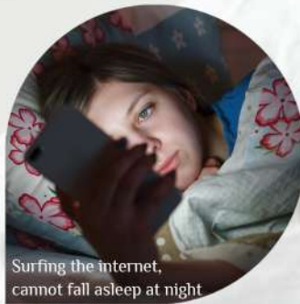
Surfing the internet, cannot fall asleep at night